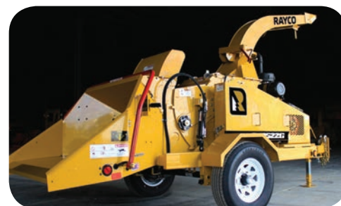
130 hp GM Gasoline Engine