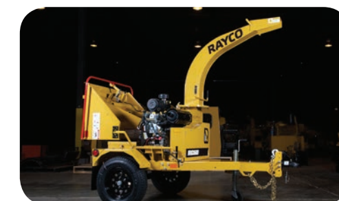
Available with 25 hp Kohler or 35 hp Vanguard Engine