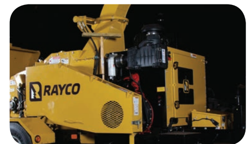
Powerful 160 hp Cummins Engine

Note: *Tier 4i - US only *Tier3 - Non-US