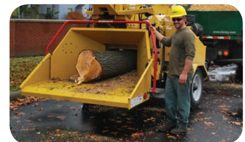
Large Feed Table with 19-inch x 24-inch Infeed Opening