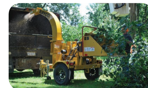
Versa-Feed Automatic Feed Control