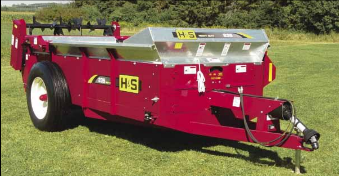
Model 235 - 235 Bushel, Struck level 143 cu. ft.