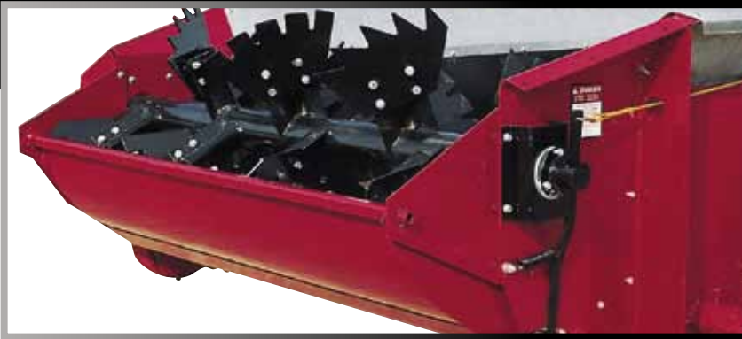
The rear pan is optional on all models.