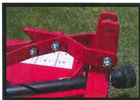
Floating Hitch for unlevel terrain