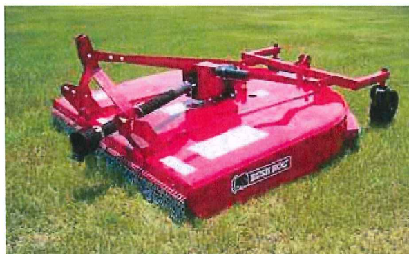
BH27 with Dual Tail Wheels Shown with Chain Shielding Selection