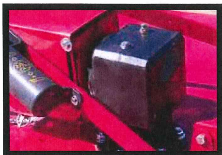
Quick Detach Gearbox Shield